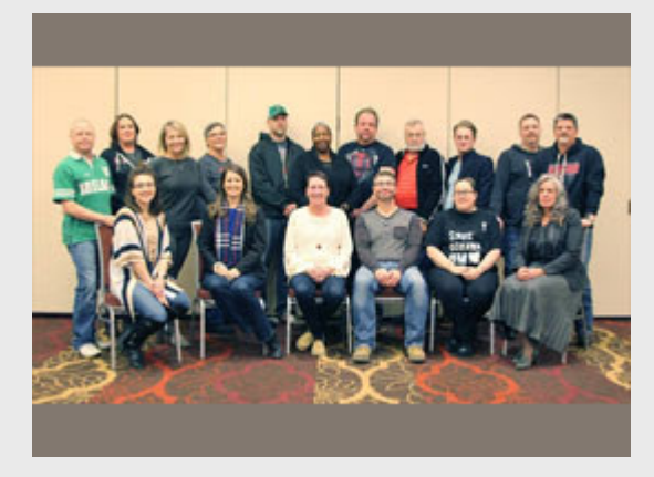
Alberta activists gather to fine tune outreach skills and review plan for the provincial election.