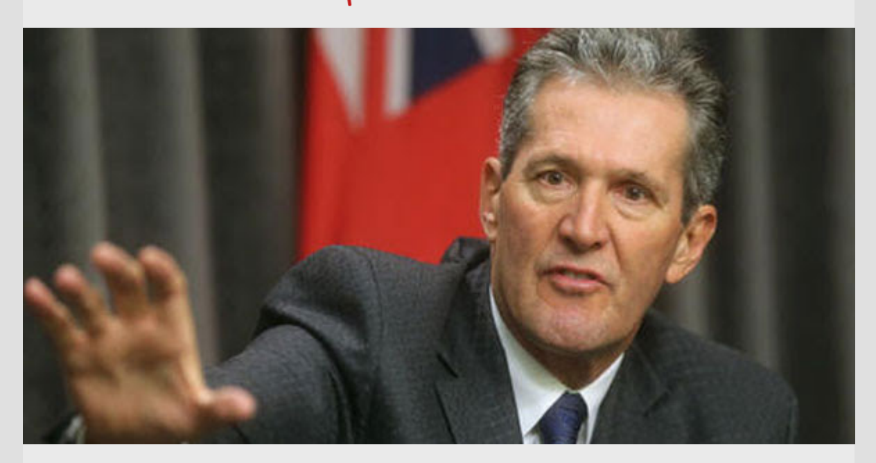
Manitoba Premier attempts to win popularity with tax cuts that threaten core public programs, schools and hospitals.